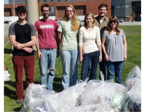
ECO Club members pose for a group photograph during the spring 2012 building audit.

A positive change in the amount of trash going to the local landfill has been seen since placement of the new style of recycling bins in buildings across campus was completed. Results of the second annual building audit conducted by IUP's ECO Club this past semester showed a whopping 36% increase in overall recycling – which means less recyclable materials are making their way to the landfill.