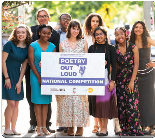
2023 Poetry Out Loud National Finalists