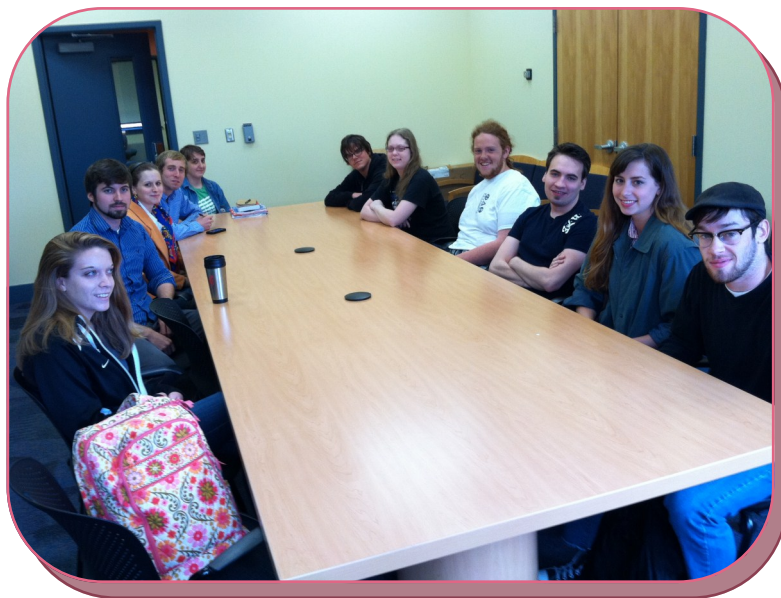
German IUP ITV students