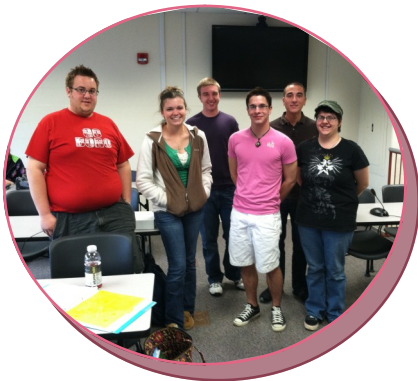
German Edinboro ITV students