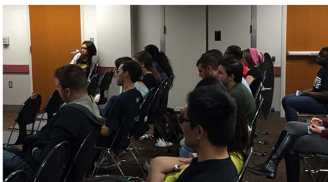
Students during the discussion that followed the film Maria full of grace .