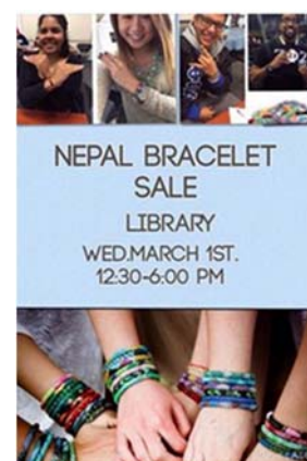
Sample fliers of the events she was involved