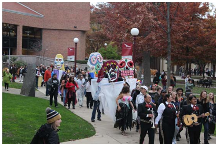
Pictured: Day of the Dead Parade, Oct. 31st in the Oak Grove