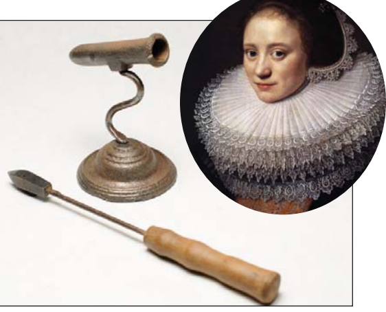
A goffering iron produced elaborate frills, one at a time, as linen fabric was stretched over the hollow, rounded iron. It was heated by inserting the wood-handled lug whose metal end had rested in a fire.

The exhibition explains how different irons evolved over time. Visitors can see a wide range of implements displayed in galleries by theme: History of Irons and Ironing, Domesticity, and When Irons Are Not Just for Ironing. Historic portraits of individuals dressed in pressed ruffles and pleats, from the museum's collection, indicate the iron's role as status object.