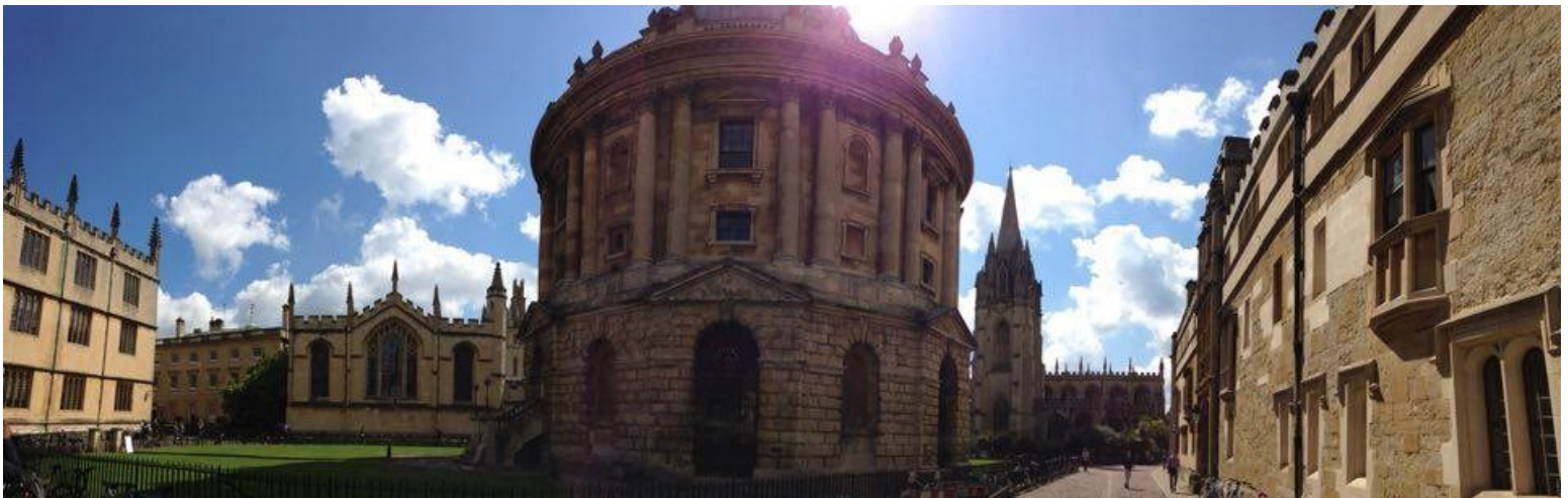
Radcliffe at the University of Oxford

Participating in this study tour was an inspiring, eye-opening experience. I encourage all future SAHE students to consider participating in a study tour. I am thankful for the partnership between IUP SAHE and BGSU, for without them, I would have never been able to explore differing student affairs views and practices abroad.