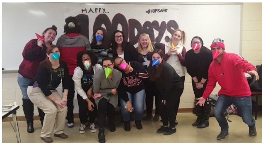
ASD hosts the second-year students' celebration of 100 days until graduation!