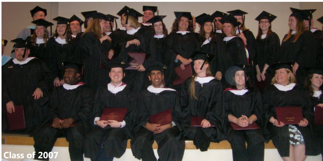
Class of 2007