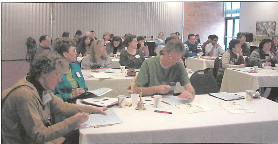
Some participants in spring workshop Learning Styles in the University Classroom: Fact or Fad?