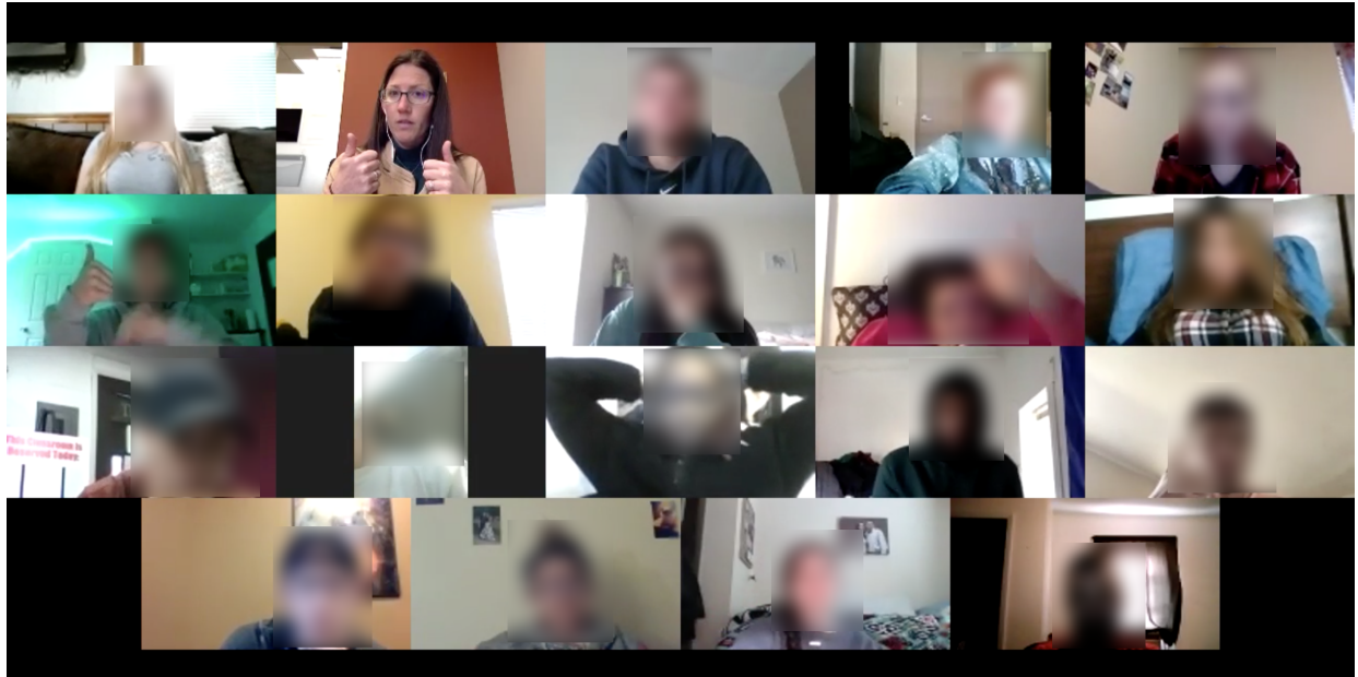
Faces blurred to protect student privacy.

Screenshot 2: Full Group Video Chat. During these full group Zoom sessions, I would discuss the current assignments, take questions, and demonstrate technical or formatting skills by sharing my screen.