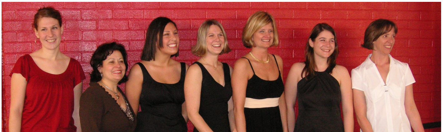
3rd School Counseling Cohort (above); 8th Community Counseling Cohort (below)