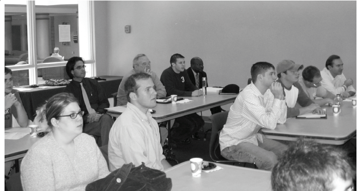
An attentive audience is fascinated by dazzling regression estimates.