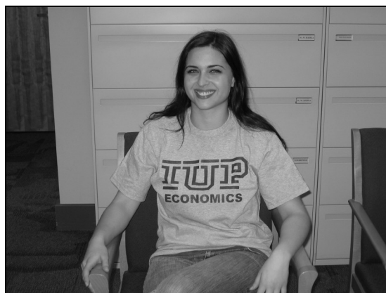
Available in gray and crimson!

*Any address provided here will only be used to mail out T-shirts. If you need to update your mailing information, please use the Alumni Information form.