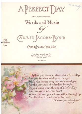
The Music Library has this copy of Jacobs-Bond's most successful song.

That said, this music is wonderful for research. It can have beautiful covers and the music reflects the times in which it was published. For example, we have several pieces by Carrie Jacobs-Bond, who not only composed the music and lyrics, but also did the art work on the covers and had her own publishing company. She was very successful in the early decades of the twentieth century. We recently acquired one more of her nearly two-hundred compositions. Today many large sheet music collections have been digitized, since the music and art work are in "public domain," making them easily available for study. The largest collections have links from the Orendorf Music Library home page.