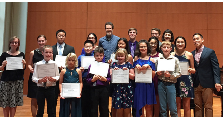
2019 Dorothy Sutton Festival