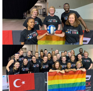
Pictured below: Office staff with the IUP Volleyball team.

The office was proud to sponsor the IUP Volleyball team during their Diversity and Inclusion night on October 13th. The team's Statement on Inclusion reads: "At IUP Volleyball, inclusion means accepting all differences and coming together to support and love one another. Inclusion is where people are heard and everybody can voice their opinion while feeling like they're in a comfortable and safe environment. Keeping an open heart allows us to form genuine friendships and connections within our team. We value inclusion in our team culture and incorporate ways everyday for us to express ourselves as individuals." We thank the players and coaches Lorelle and Pete Hoyer for these meaningful efforts.