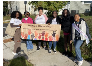
Above: DEI Alliance members marched in the 2023 Homecoming Parade.