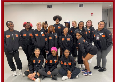
Above: URBN Dance Group model their new team jackets! :)

need help with funding? Through a generous donation by two alumni, support is available for DEI efforts on our campus. Examples of fundable initiatives include speaker fees, Aramark event catering, printing services, group apparel and miscellaneous items for recognized student organizations, student attendance fees at approved events, and more! Contact social-equity@iup.edu for further information and to submit a funding proposal.