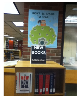
Check out the new book shelf in the Information Commons

school at Indiana State University. I had the good fortune to work in Special Collections and Archives while studying at IUP, where I helped with projects like our Coal Culture website and community events. My time in the library impacted me both educationally and personally. While working as a graduate assistant at Indiana State, I often looked to my time at IUP for ways to motivate the students I worked with. Now that I have returned to IUP, I look forward to learning even more as I work alongside the faculty, staff, and students who make up the IUP Library community.