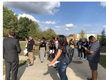
Above/Below: Students discuss their observations of campus spaces.