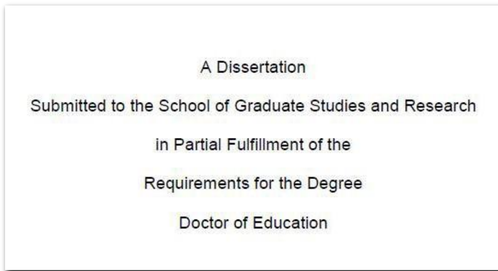
Figure 2. Center statement on the dissertation title page.

Note: Do not include a page number on the title page. See full page examples in the Appendices.