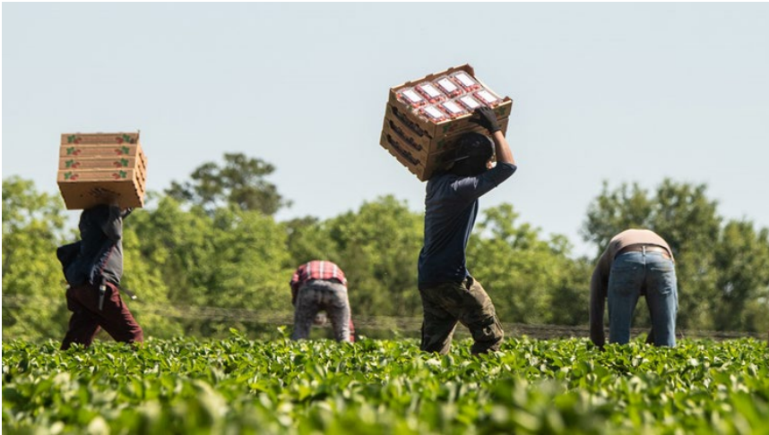
Figure 14.6. Farmworkers carrying boxes of fruit.

foreign-born Latino men bear particular risk?” She found that young, Latino men were more likely to suffer heat stroke and death because they typically performed the more strenuous jobs in farm work, including being a carcador , or box staker, which requires moving boxes weighing between 20-40 lbs. while in the direct sun (see Figure 14.6). It’s the intersection of their gender and legal status that creates a context in which Latino men become structurally vulnerable to severe dehydration and death. This is a good example of a feminist ethnography because Horton’s research centers questions about gender, power, and marginalization in America’s farmlands.