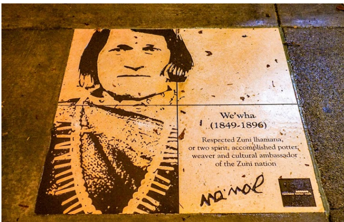
Figure 14.3. Sidewalk art depicting We'wha, famous two-spirit Zuni cultural

Many Native North American cultures have traditionally recognized more than two genders. For example, the Dine/Navajo, recognize at least four genders: there is the feminine female ( asdzaan ), masculine male ( bastiin ), a person born male with a moving gender ( nadleehi ), and a person born female with a moving gender ( dilbaa ). Among the Zuni of the southwest U.S., the Lhamana are individuals that live as both male and female genders simultaneously. The Lhamana have critical roles in society as mediators and religious leaders, and they participate in both traditional male and female activities in society. Additionally, the anthropologist Will Roscoe conducted archival research and was able to identify alternative gender figures—which today are called Two Spirit —in 150 of about 400 tribes of the U.S. and Canada. Today, Two Spirits may biologically exhibit male or female genitalia, but like the Lhamana , their spirits are recognized as a blend of male and female (see Figure 14.3).