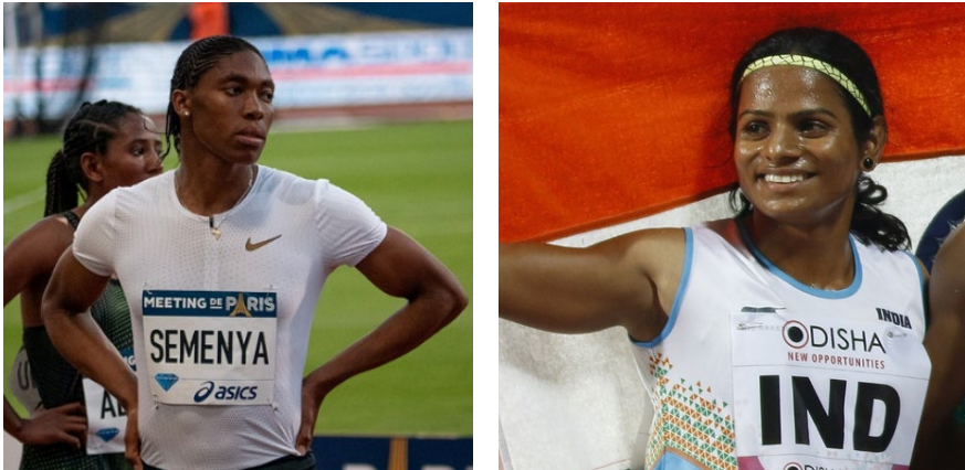
Figure 14.4. Famous intersex athletes Caster Semenya and Dutee Chand.