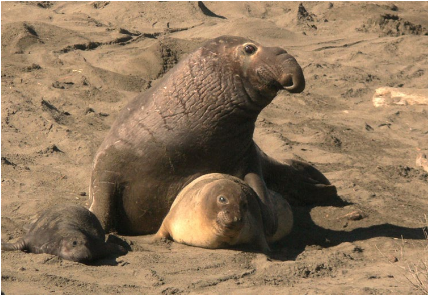
Figure 14.1. Male, female, and juvenile elephant seals, depicting the pronounced sexual dimorphism between males and females.

However, as a primate, humans have less sexual dimorphism than the other great apes, such as gorillas and orangutans (see Module 5: Primates). In general, humans exhibit a small degree of sexual dimorphism (up to 15%), meaning there is not a pronounced difference in size between males and females in our species. The most obvious differences lie in the morphology of our genitals and breasts. Additionally, human males tend to have more musculature, less body fat, and taller statures than females, although there is clearly a high degree of variation between the sexes. The human sexes also have varying degrees of hormones, including testosterone and estrogen. Interestingly, evolutionary biologists have found that the sexual dimorphism between humans seems to be decreasing through time, meaning males and females of the human species are becoming more physically similar.