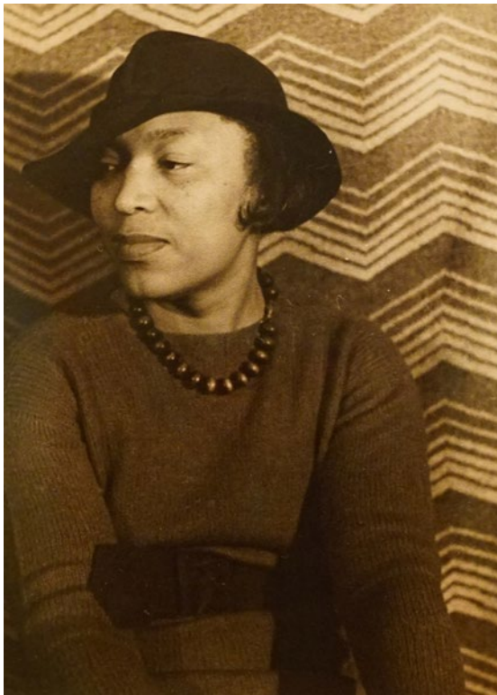
Figure 14.5. Zora Neale Hurston is a famed folklorist and Black anthropologist in a field where women were underrepresented as professionals in the field or as the subjects of anthropological research.