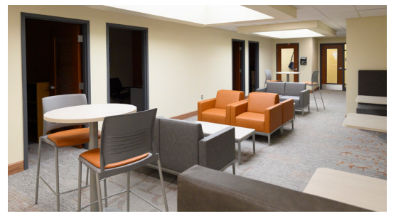
VISIT THE IUP CAREER AND PROFESSIONAL DEVELOPMENT CENTER.