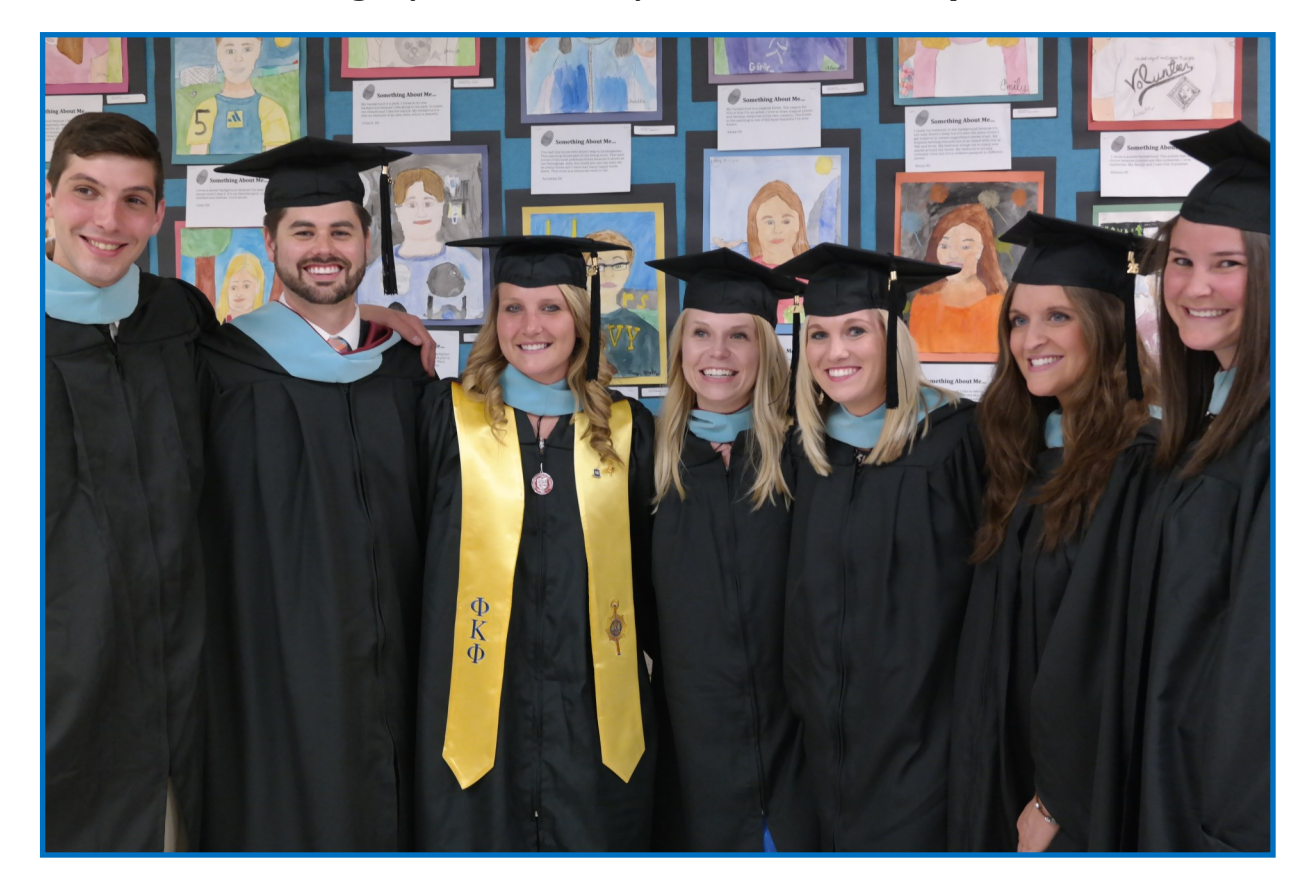
School Counseling Cohort 9 (above) and Clinical Mental Health Counseling Cohort 14 (below)