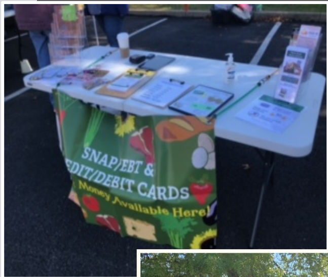
SNAP table at the Indiana County Farmers' Market

From August to October, SAND members attended the weekly farmers' market and assisted shoppers with choosing the best quality fruits and vegetables. SAND helped with menu and recipe ideas for the produce. SAND members also helped those receiving Supplemental Nutrition Assistance Program (SNAP) to understand how best to use their benefits and how to choose produce to complement other food assistance the individual or family received. Produce is often hard for the SNAP participants to obtain, but thanks to SAND, both the SNAP participant and the local farmers benefit, bringing often missed food sources from the farmer to those in need.