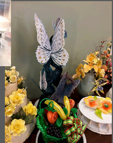
Sugar Showpiece: Butterfly