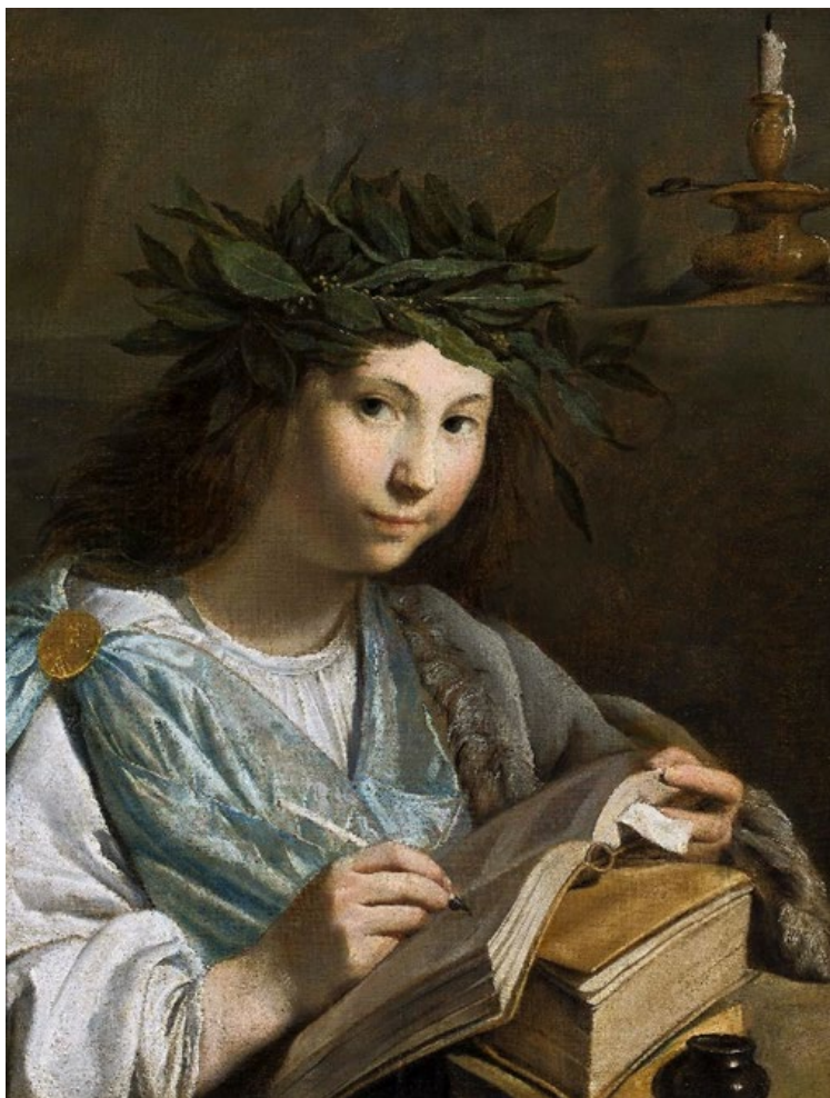
Johannes Moreelse Clio-Muse of History