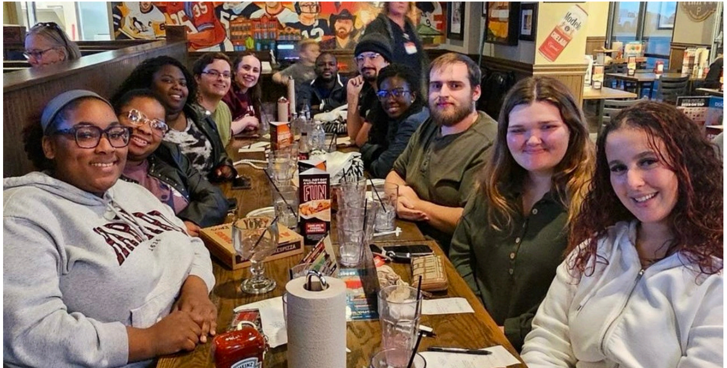
ASD Members at a Primanti Bros Fundraiser dinner for ASD.