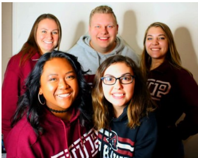
The 2019 (Outgoing) ASD Executive Board