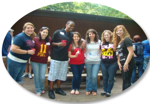
Make Your Mark at Kick-Off!