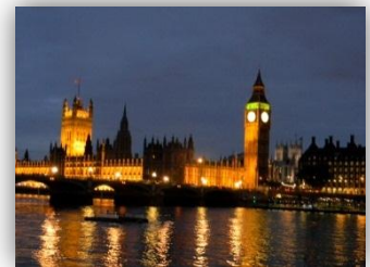
Parliament & Big Ben