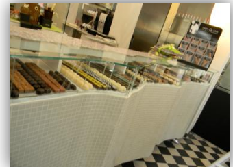
Chocolate shop in Bruges