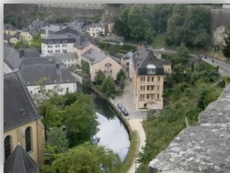
A view of Luxembourg