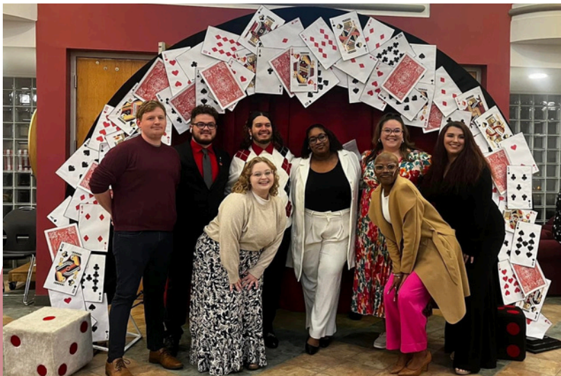
Spring 2024 Housing Banquet