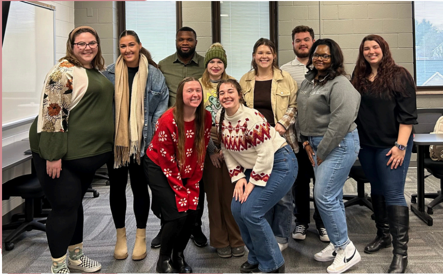
The second-year students on their last first day of school