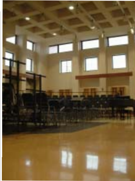
The choral rehearsal room

For more than 35 years, the IUP Music Department has been able to attract quality students on the merit of the faculty alone. Finally a great faculty gets a facility that they deserve. I was told as a freshman in 1971 that the building would be completely remodeled by the time I graduated. I think they meant by