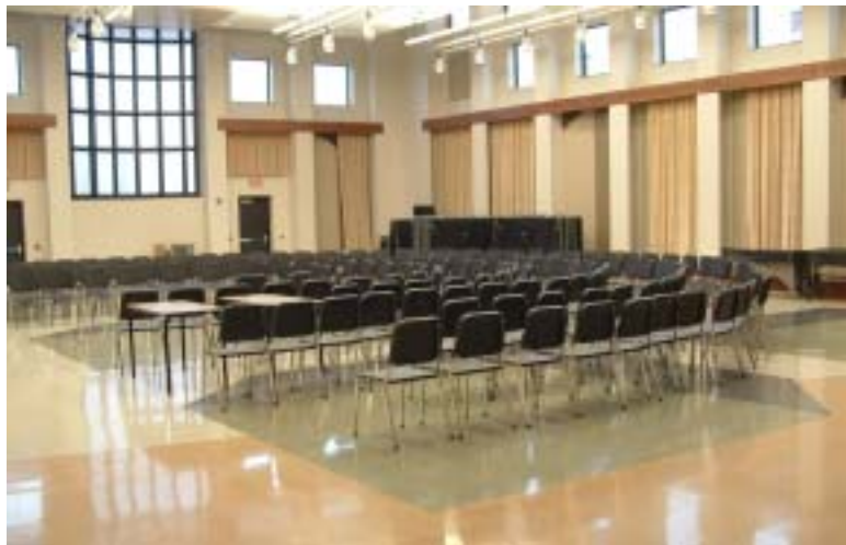
The large ensemble rehearsal room